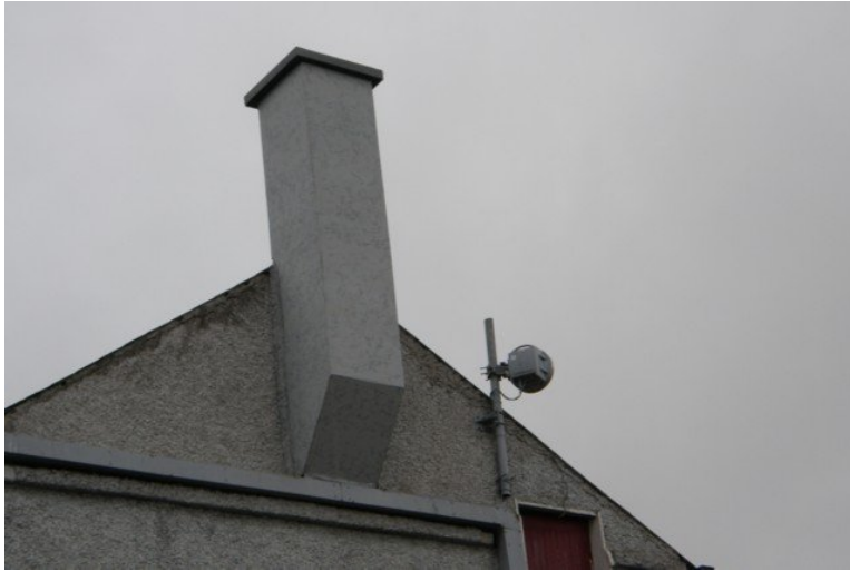
Transmitter Site Photo